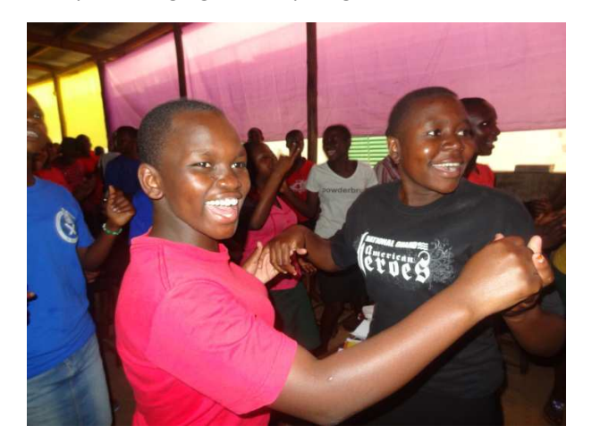
fun, praise and worship. The incoming leaders were prayed for and the outgoing given certificates of participation. Finally the cake was cut and enjoyed